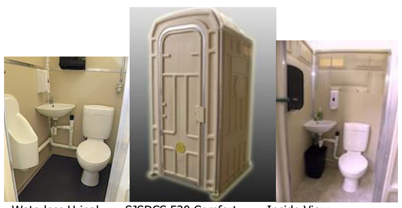
Waterless Urinal SJSDCS