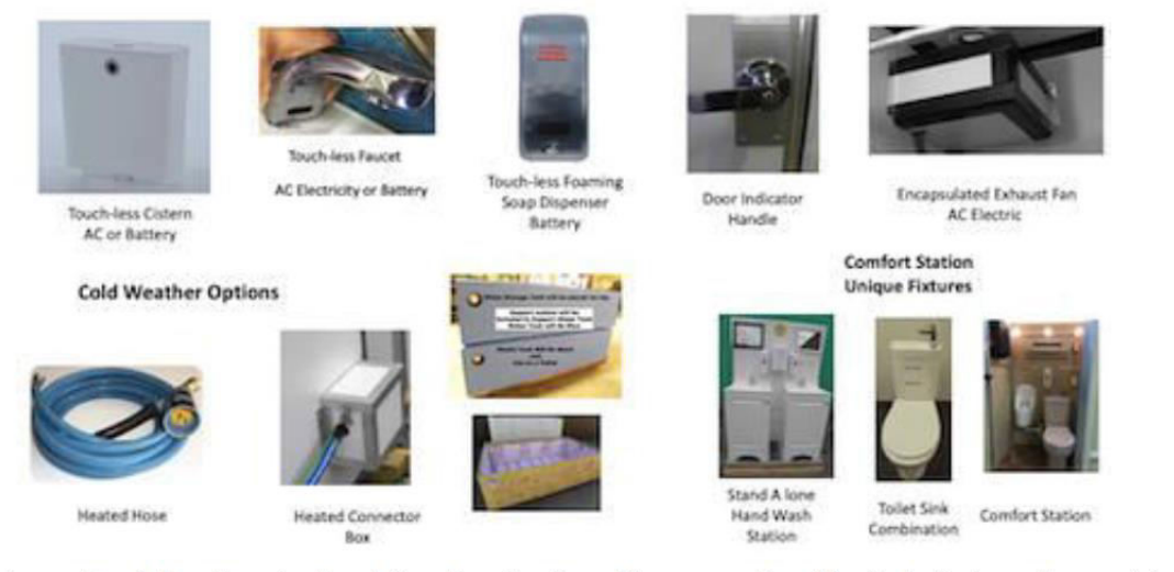
Touch-less Toilet Cistern – Touch-less Faucet – Touch-less Foaming Soap Dispenser – Door Handle Indicator – Encapsulated Exhaust Fan – Heated Water Hose – Connector Hot Box – Encapsulated Water and Waste Tanks – Unique Comfort Station Fixtures

Two Stall Ground Level Lavatory Building Exterior Plumbing upgrade Not Shown