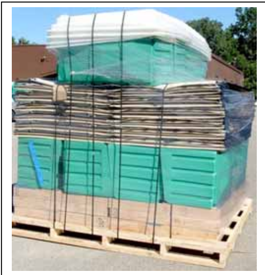
12 Complete Model FPT 300 Ready to Ship