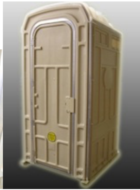
SJSDCSS 520 Comfort Station